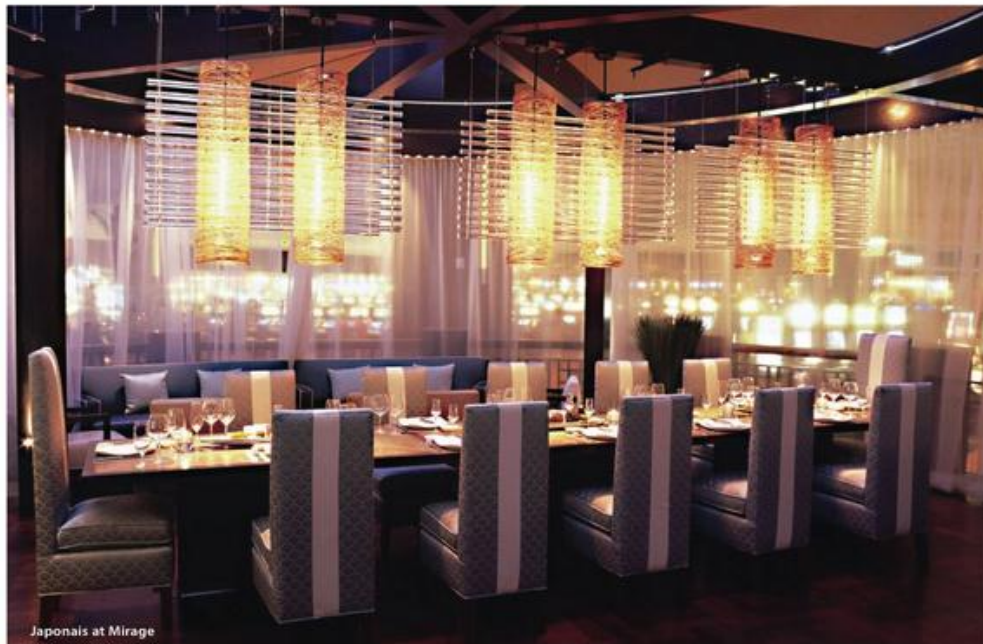
Japonais at Mirage