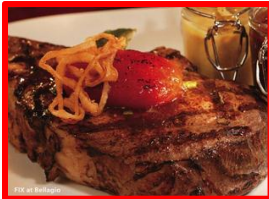
FIX at Bellagio

No matter if you're talking ambience, clientele, design or cuisine, restaurants that exude sexiness abound in Las Vegas. From the most chic new spots in Vegas and those that have a party vibe, to those that offer intimate VIP rooms, there's an eatery to fit every mood. Please keep in mind that most restaurants on the Strip get booked up quickly between the hours of 7-9 pm; it's always a good idea to have a reservation.