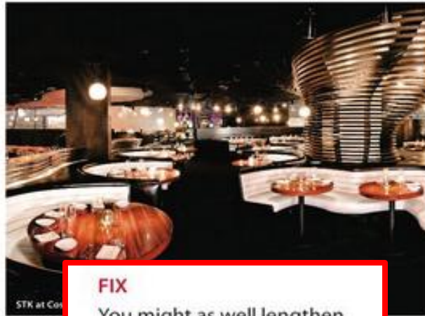
STK at Cosmopolitan

OK, the dining room at this only-in-Vegas restaurant doesn't figure in our sexy list, but its attached Fireside Lounge is a bird of another color. Chic, black-cocktail-dress-clad waitresses take your order as you recline on the circular booths and get lost in the bubbling fire pit—and your sweetheart's eyes. 2985 Las Vegas Blvd. S., next to the Riviera, (702) 735-4177